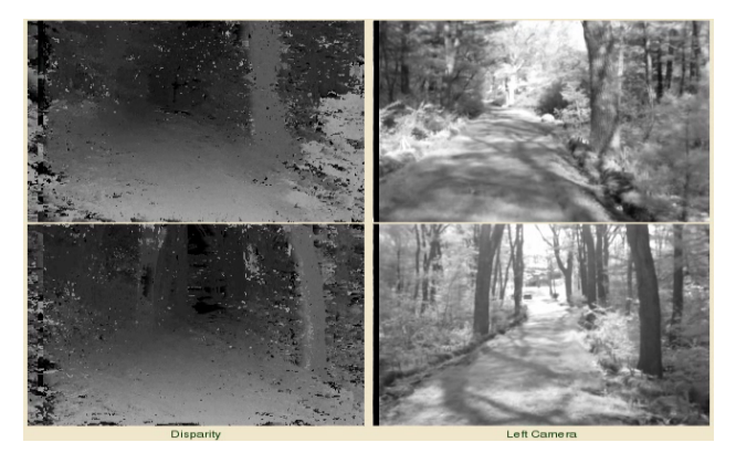
Figure 3. Example results along an access road. Bright pixels are closer.

Our current design achieves camera-rate performance approximately 40 320x240 frames per second—from image capture to display on the host computer. This design utilizes 57% of the logic resources on the Xilinx XC3S2000, 26 of the 40 BRAMs, and can be clocked up to approximately 26MHz. With appropriate cameras, the design could process 320x240 8-bit greyscale images at over 150 frames per second.